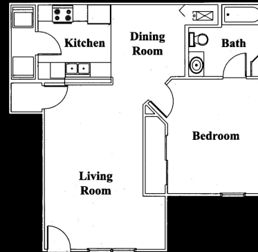
One Bedroom Floor Plan 689-768 sq. ft.