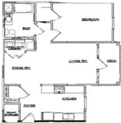
1 Bedroom: 752 ft 2