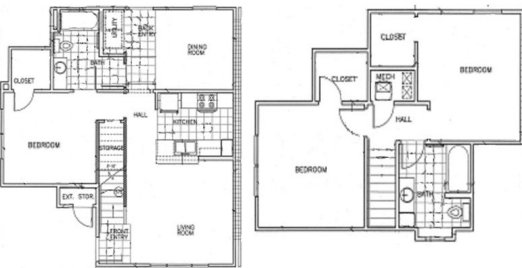
3 Bedroom: 1359 ft 2