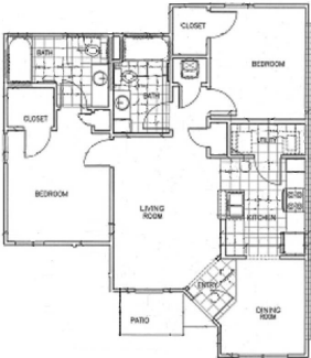
2 Bedroom: 962 ft 2